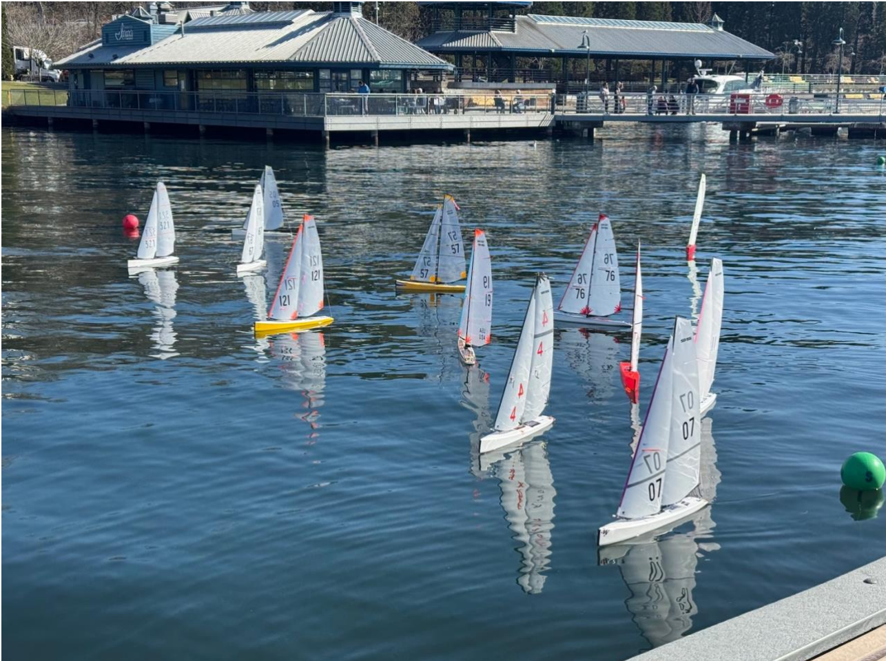
Our opening day DF95 regatta in March had 11 boats and some nice sunlight, bit little wind.