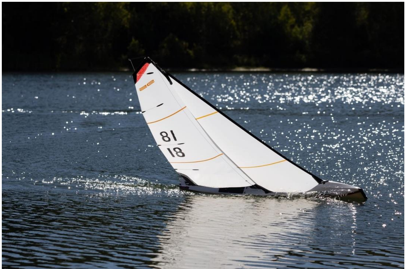
DF95s in wind and flat water. 95s have impressive sailing technology for the costs.

SMYC continues to sail IOM outside the Waterwalk, which we have done with 8 monthly regattas per year since 2010. Expect the combined Seattle/Gig Harbor 2026 schedule to be very similar to 2025 (shown on last page), so check it out next January or February.