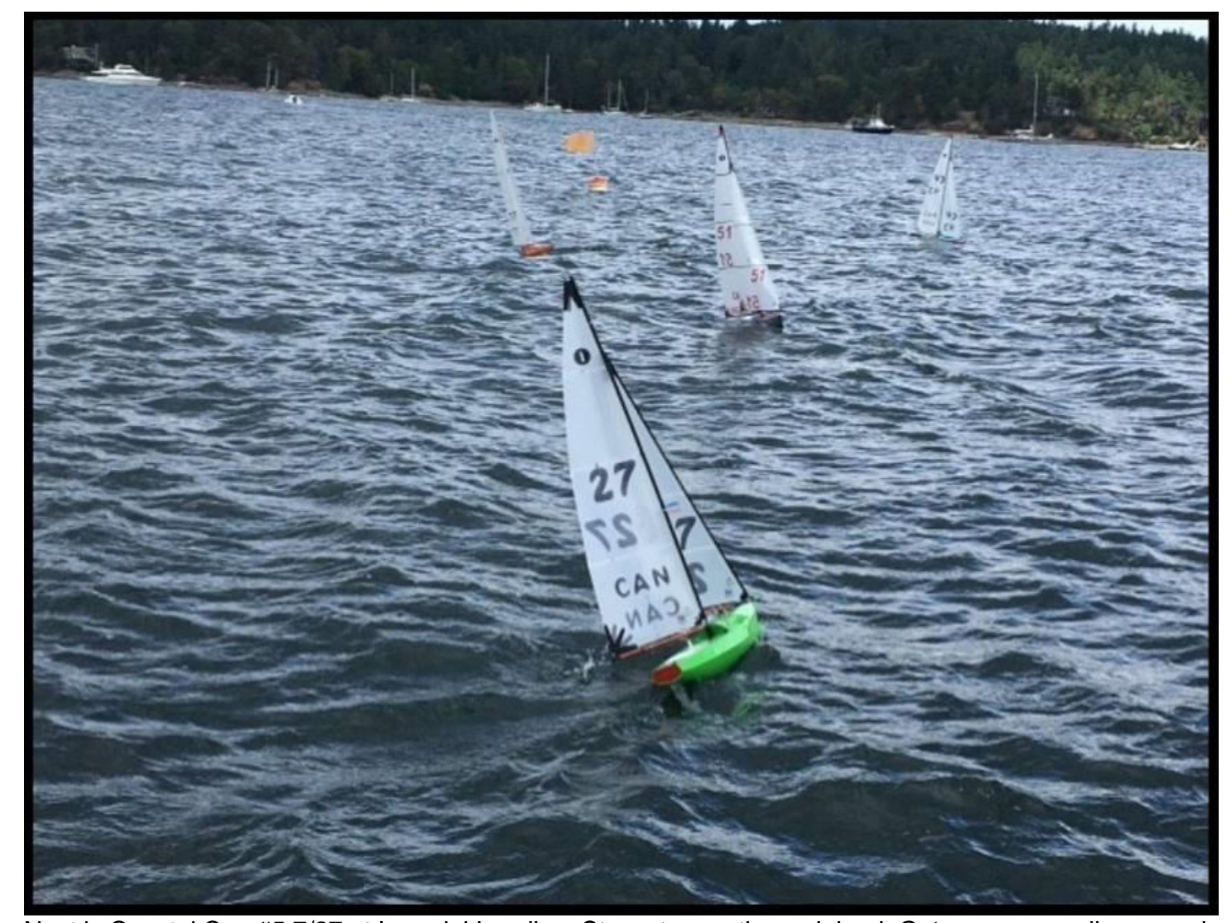
Next is Coastal Cup #5 7/27 at Imperial Landing, Steveston on the mainland. Get your car pooling organized...