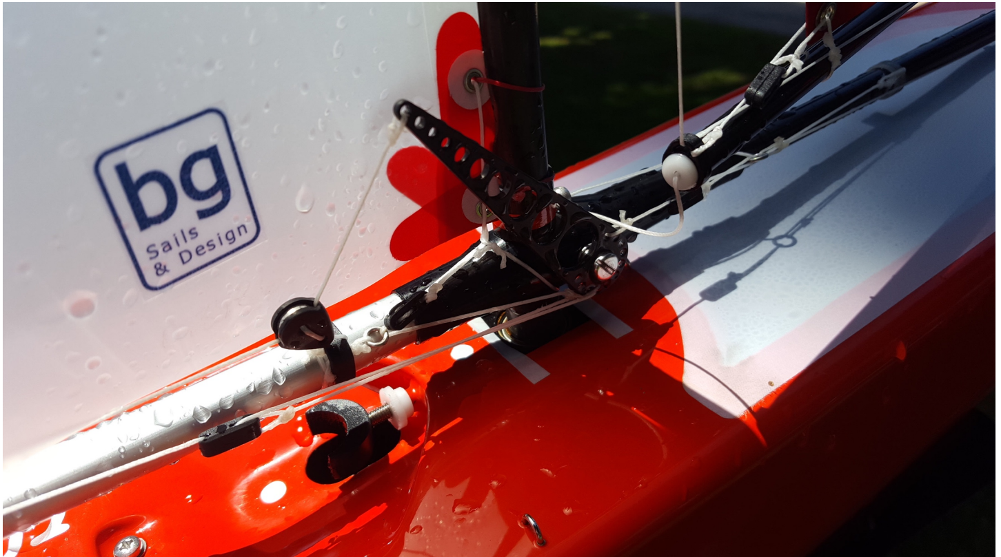
A close-up of Bruce's Grunge with swing rig. Rake adjusts with plates at deck surface, and Bruce changed to more rake for the second day. His B, C, and D rigs are conventional and would be placed aft a few inches in a shallow recess where the ram is seen. The angled lever is called a "gizmo", which is fiddley to set up, and will allow you flatten the rig for pointing when needed. Notice how low to the deck the booms are.

Full Results: http://www.ibextrax.com/RC2018/Results/0801MN.pdf