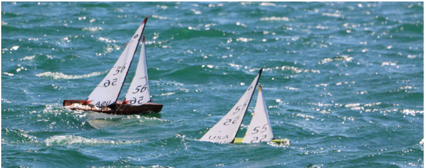
USA 55 (Golison) and USA 56 (Atkinson) upwind in the big wind in B-rig.