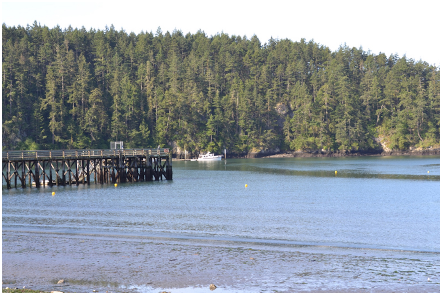
A portion of the 400' long Bowman Bay dock from the 1930s with the course is set on the north side. We're just waiting for skippers to gather on the end of the dock and to start the tape. Jerry Brower photo from May 2018.