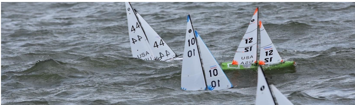
Upwind the first two days we were fast on port (with waves almost parallel to our course) and slow on starboard (pounding directly into them). Nail biting finishes were mostly parallel and close to the dock such as in this image.