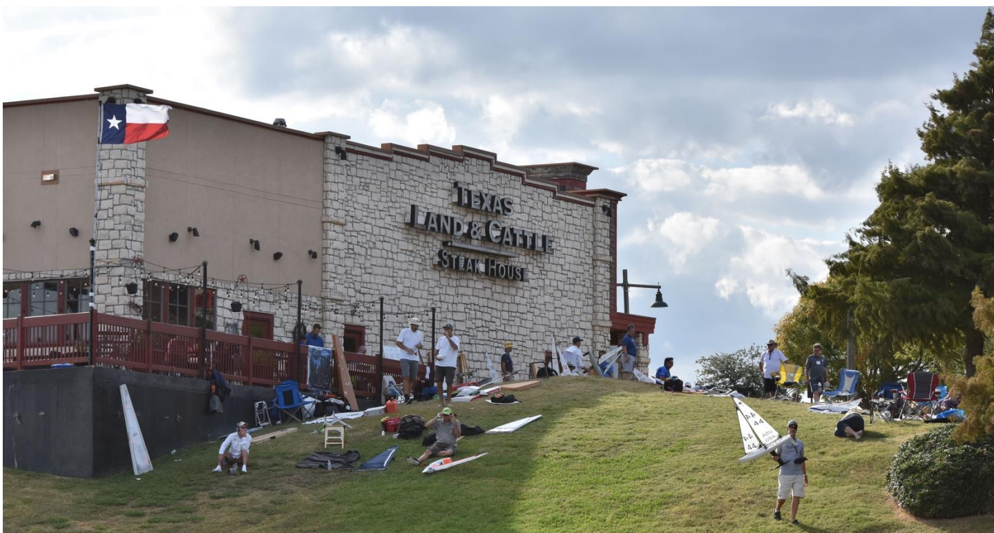
The excellent staging and elevated viewing area helps make this a very special venue. The restaurant provided great lunches, our restroom, shade, and it was only a short walk from our hotel. The Texas flag showed wind direction and suggested the strength. We had a lively and tasty Saturday night dinner at Texas Land and Cattle too.