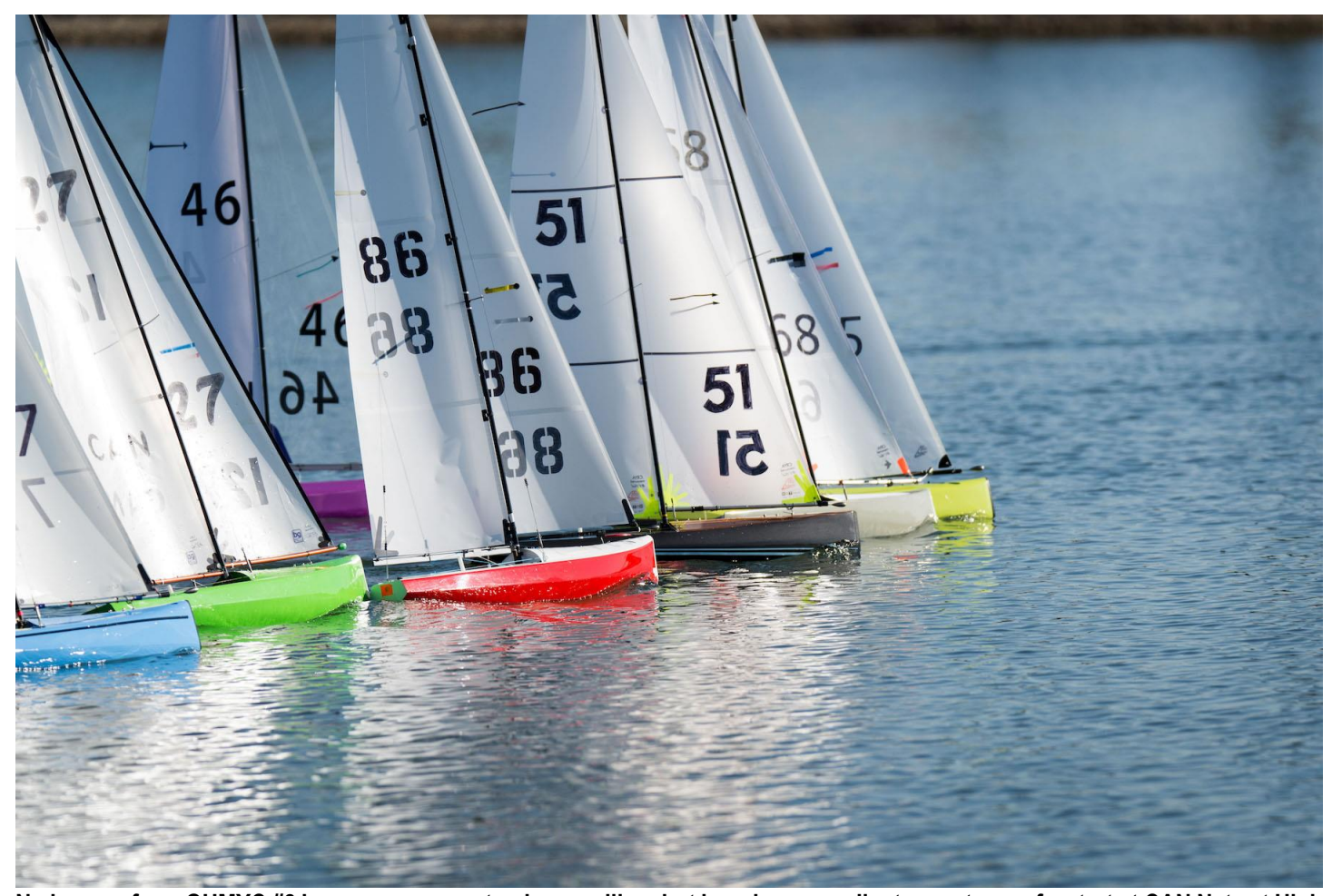
No images from GHMYC #8 because we were too busy sailing, but here is an excellent recent one of a start at CAN Nats at High River in Alberta, where the smart money wants the outside pin. CAN 46 is in the 2<sup>nd</sup> tier without wind.