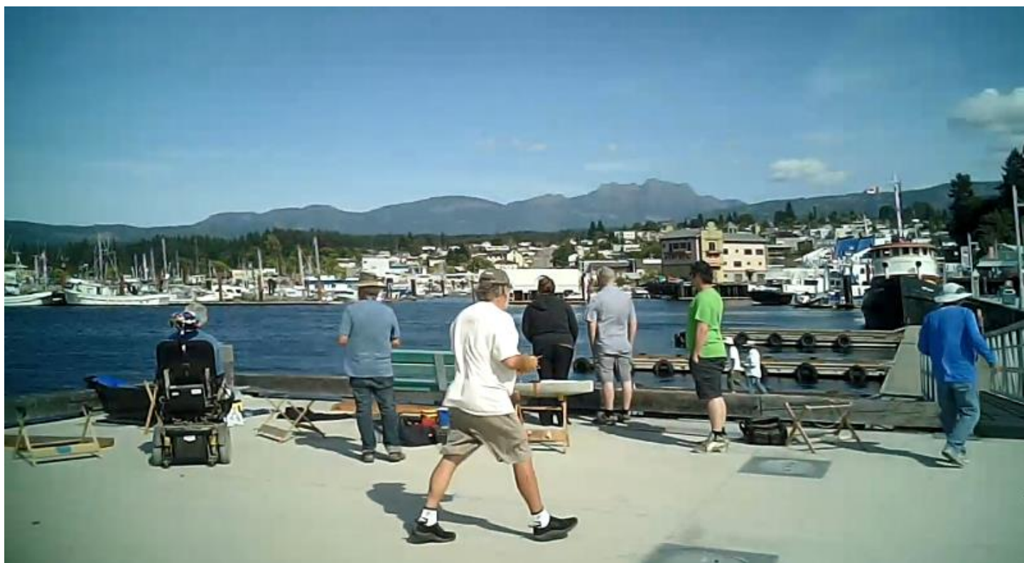
The view from Harbour Quay looking back to Port Alberni. Art Prufer extracted this image from his video to show what the pier looks like. Harbour Quay is David Cook approved!