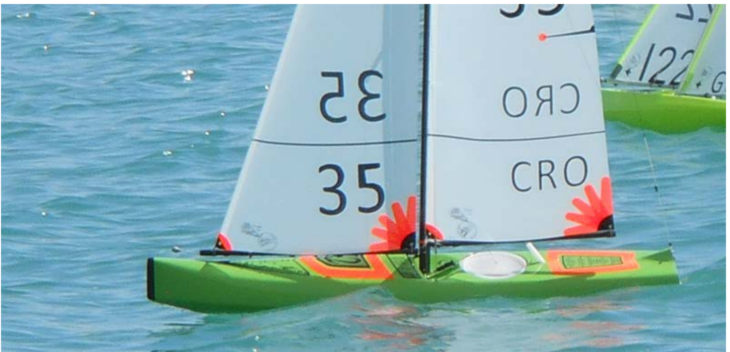
Here is Zvonko Jelacic sailing his new Kantun 2 to a well-earned 2017 WC Championship, his second WC win. It was in doubt until the last race thanks to Beltri and Walsh keeping the pressure on. Everything on this excellent boat you can purchase from Jelacic Sailing, and you have the option of purchasing it completely assembled. Delivery is stated at 10 months. The trim guide is on labels on the deck.