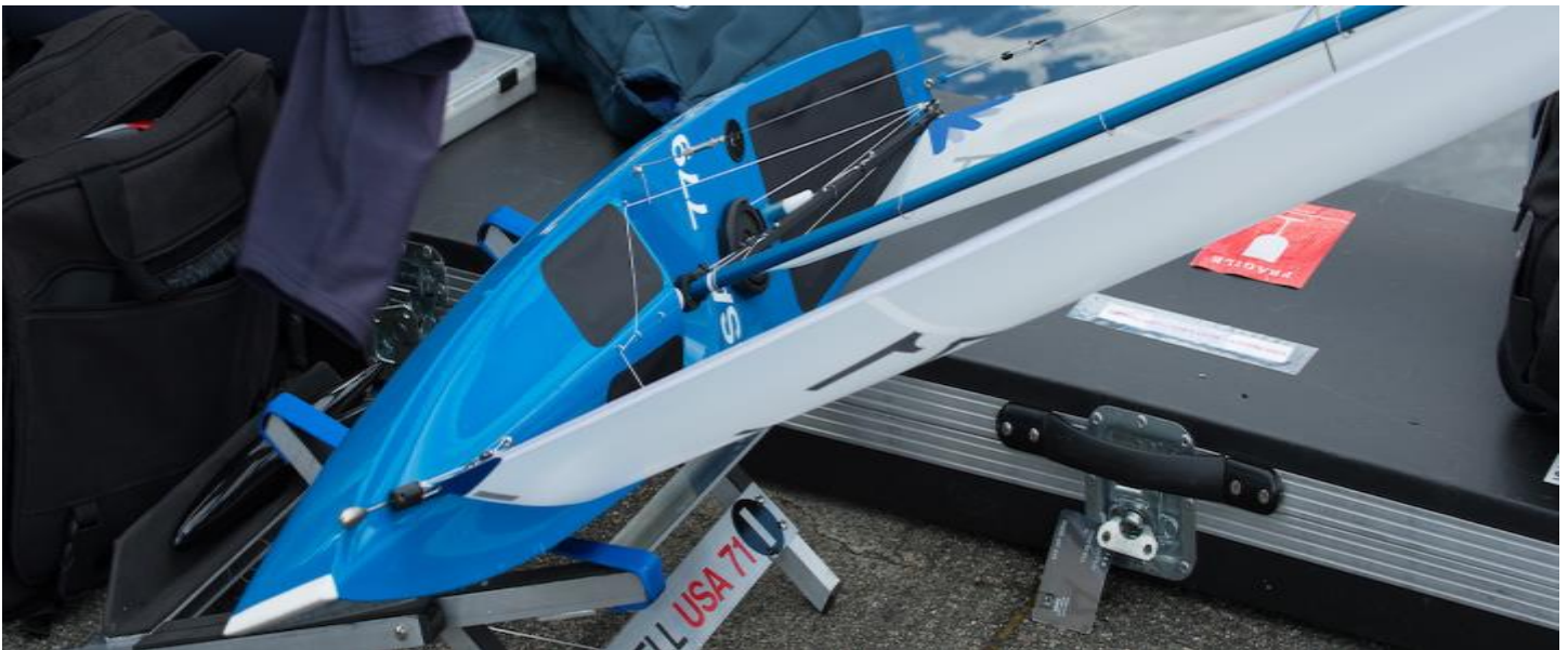
Mirage Radio Yachts (Jeff Byerley) MOJO for sale (new in Jan 2015), with #1 & #2 Rigs (#3 rig is negotiable). Complete boat w/ RMG & digital rudder servo. Bantock fittings throughout. $2,200 OBO. Located in Richmond, CA. Contact Gary Boell: gboell at innovaflavors.com (Editor recalls the first time Gary sailed this one at our 2015 COW REGATTA – fastest in our fleet out-of-the-box.)